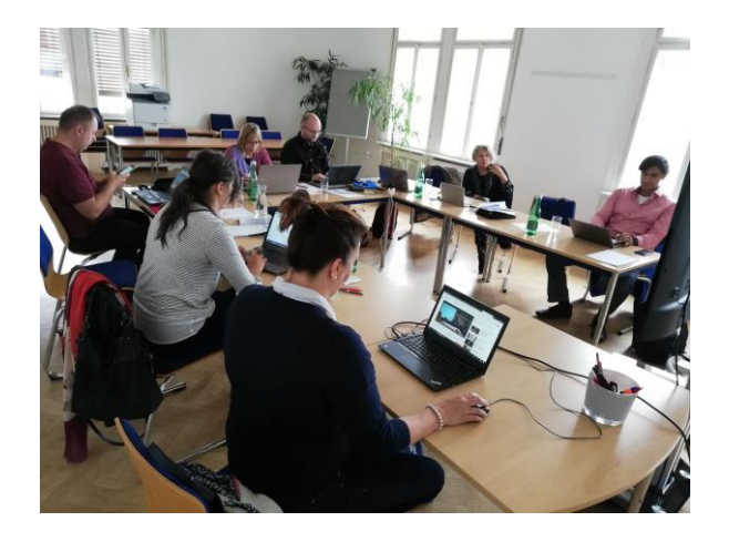
Intensive debates during the 5th transnational meeting in Vienna ©

choice will depend on the needs of students. Part of the meeting was focused on the multiplier events in each country.