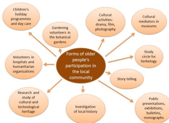
Picture 3: Forms of older people's participation in the local community

Several European projects, for instance the Norwegian Financial Mechanism fund, and the projects sponsored by the national Ministries have helped us to systematically foster practical application of older people's knowledge in their local environment. We have organized participation of cultural animators in museums and hospitals, gardening volunteers in botanical gardens, film creators in preparation of short films on active ageing, animators working on holiday programmes for children, narrators, leaders of workshops for young people with brain injuries, herbalists, environmental activists etc. Once a new action area is identified in the local community, we devote it our full attention so that our members can make the transition from acquisition of knowledge to its use in practice.